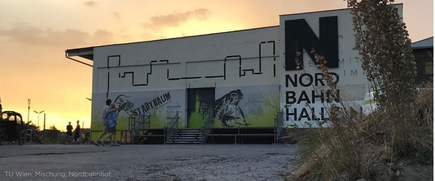
TU Wien, Mischung: Nordbahnhof