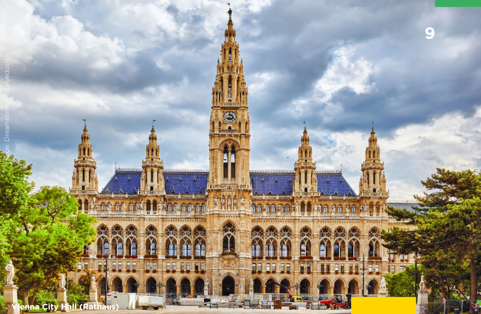
Vienna City Hall (Rathaus)