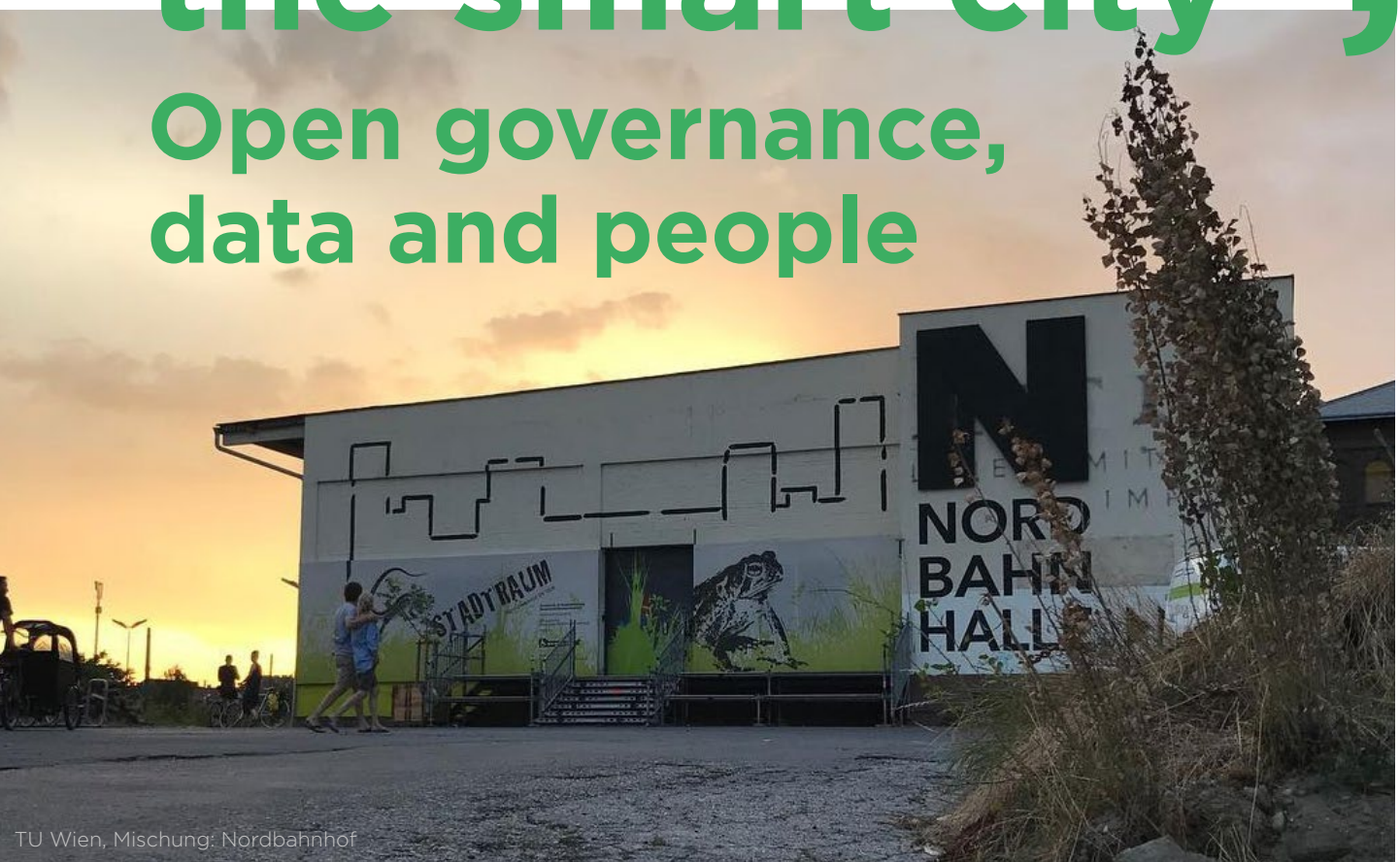
TU Wien, Mischung: Nordbahnhof